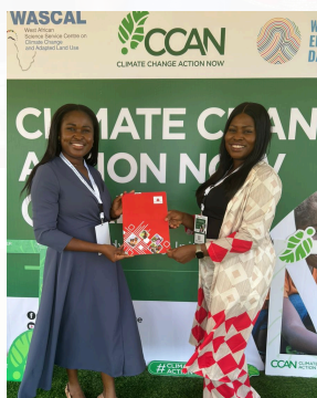
Climate Change Action Now: Participants at WASCAL's World Environment Day