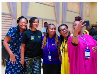
ANPOS 2025: Participants engage during the second edition of the Africa Nonprofit Summit