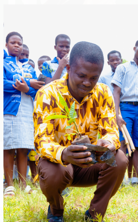
Green With Twellium: A teacher leads by example, planting hope for a greener future