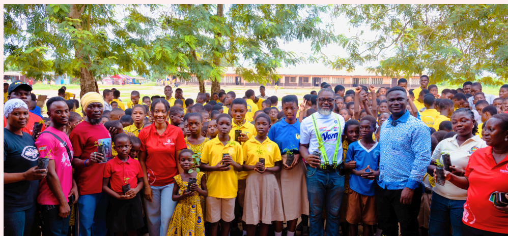
Twellium and IMPLEMENTERS teams with students and staff of Kwashiekuman M/A School during the tree planting exercise

To ensure the long-term success and scalability of the initiative, IMPLEMENTERS and Twellium have scheduled a follow-up visit in August 2025 to assess seedling health. During this phase, the teams will also provide hedging materials to support the growth and protection of the planted trees.