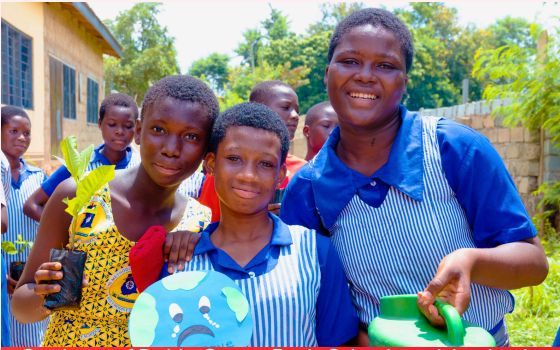
Students of Doblo Gonno Basic School participating in the tree planting exercise

The “Green With Twellium” initiative exemplifies the power of partnerships in addressing environmental challenges and aligns strongly with IMPLEMENTERS’ commitment to climate action and community-led development.