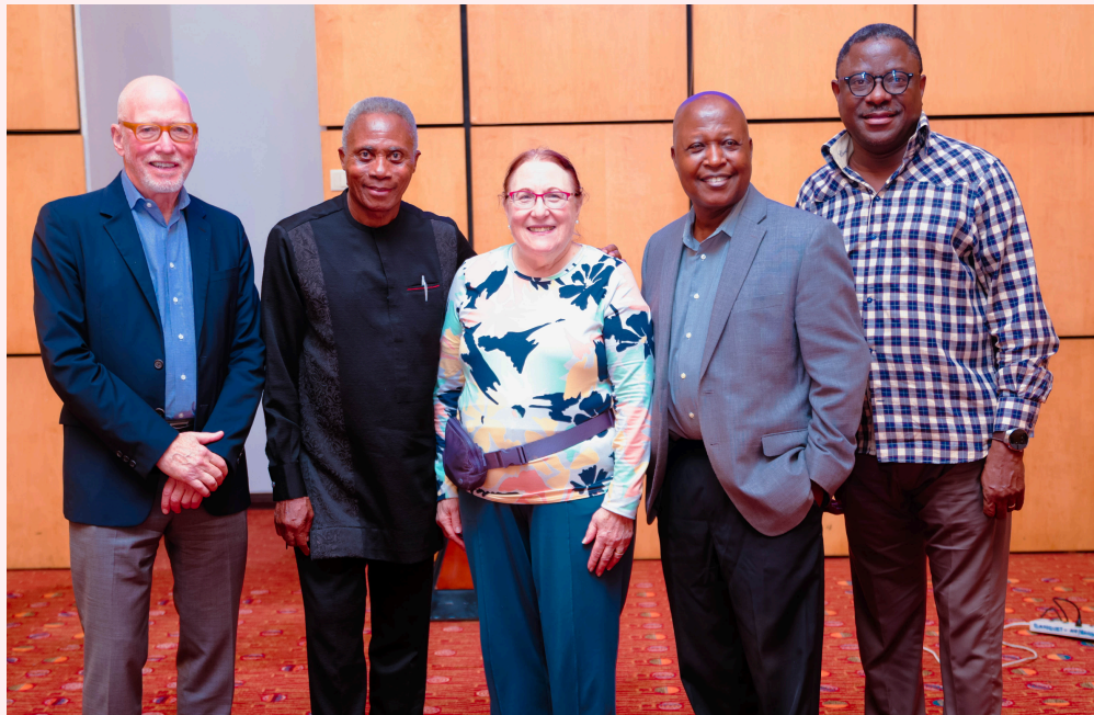
Executives of the Helping Africa Foundation pictured with attendees of the YM Promoters Meeting

As the meeting concluded, it was evident that the collective resolve to make the Yamoransa Model Labs thrive remains strong. With continued collaboration, thoughtful planning, and an emphasis on indigenous innovation, stakeholders left energised and aligned with the goal of securing lasting impact. The future of the YM Labs is being actively built by the very communities that benefit from it.