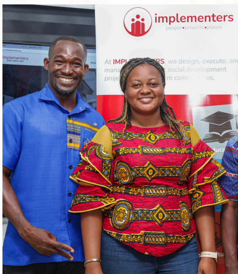
IMP's Strategic Sector Research: Stakeholders at IMP's Strategic Sector Research on Education