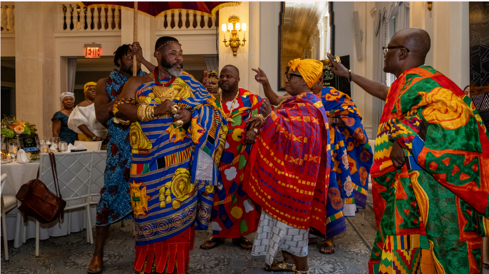
Ghanaian Diaspora Traditional Leaders grace the Yamoransa Model Gala with their arrival

At IMPLEMENTERS, we are incredibly proud to be the implementing arm of this life-changing initiative. The Yamoransa Model is more than a project; it is a movement to empower underserved learners with the tools and opportunities they deserve. We remain committed to bridging the educational divide across Ghana and beyond, and we are grateful to everyone who continues to believe in and support this vision.