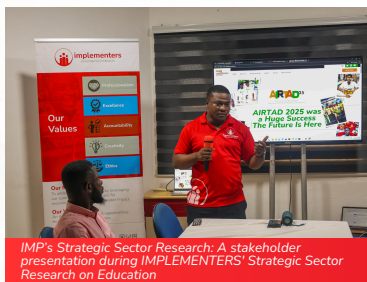
IMP's Strategic Sector Research: A stakeholder presentation during IMPLEMENTERS' Strategic Sector Research on Education