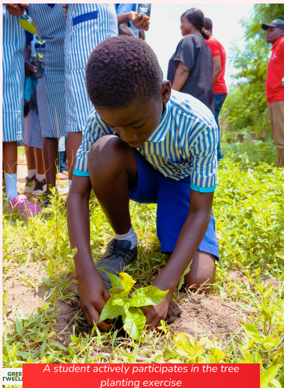
A student actively participates in the tree planting exercise

With the full participation of school leadership and students, the team successfully planted about 60 trees within the school compound. To reinforce the educational impact, learning materials were distributed to students, followed by a generous donation of beverages to the school.