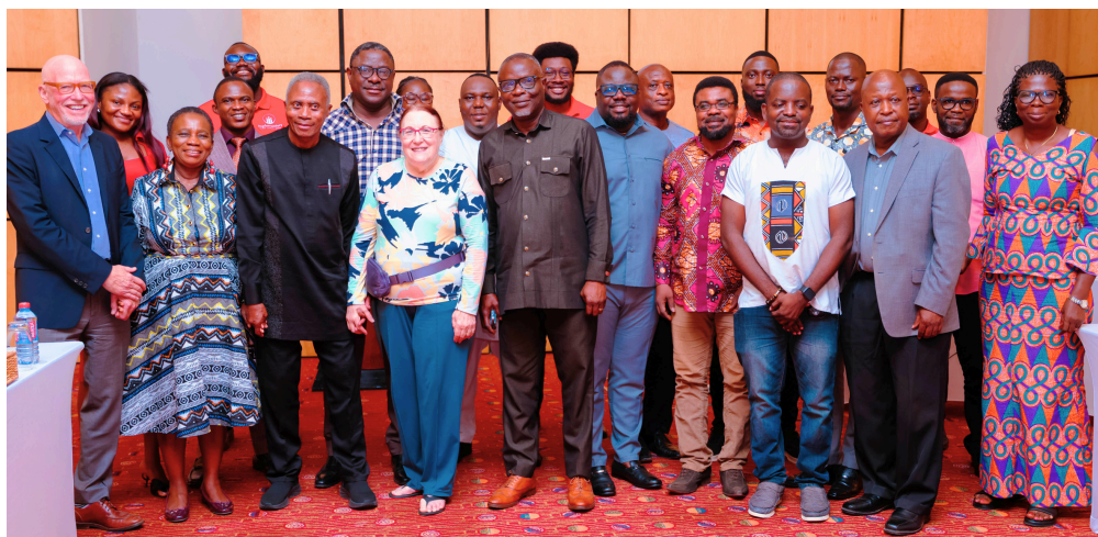
Participants with Helping Africa Foundation Executives and IMPLEMENTERS Staff

On May 9, 2025, IMPLEMENTERS and the Helping Africa Foundation convened a powerful gathering of stakeholders for the Yamoransa Model Labs Program Promoters Meeting in Accra. The meeting brought together promoters, center managers, members of Parliament, the Ghana Education Service, and development partners to deliberate on the long-term sustainability and growth of the YM Labs. It marked a defining moment in the ongoing effort to secure the future of one of Africa's most innovative educational technology programs.