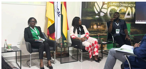
IMP's Senior Partnerships Associate joins a panel discussion at the CCAN launch.