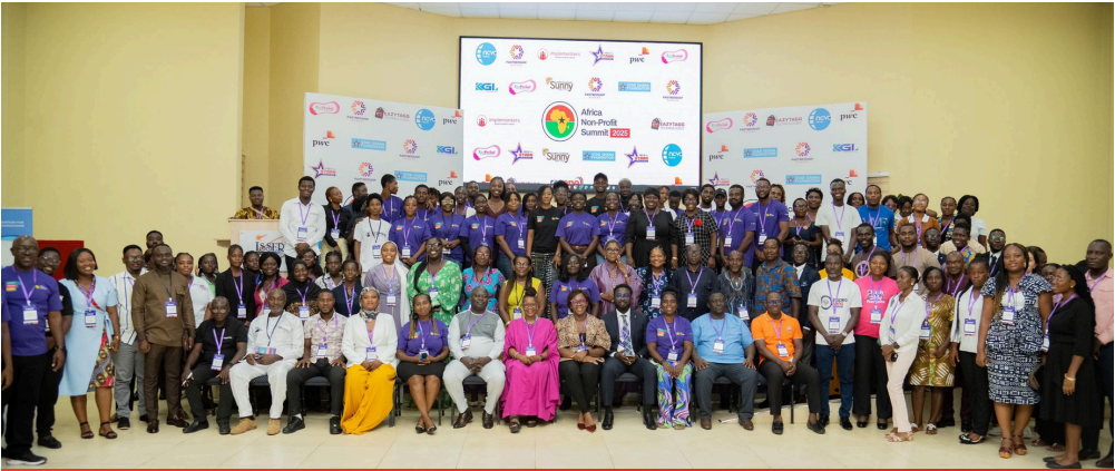
Participants at the 2025 Africa Nonprofit Summit pose for a group photo following an engaging and impactful gathering

Non-profits exist to change lives; however, many experience certain gaps that affect their work. Challenges with sustainability, storytelling, and structure often prevent non-profit organisations from achieving their full potential. The Africa Nonprofit Summit (ANPOS) was born out of this reality to offer real, practical support that helps non-profits move from intention to lasting impact. The second edition of ANPOS, held on Wednesday, May 13, 2025, at the ISSER Conference Hall, University of Ghana, did exactly that.