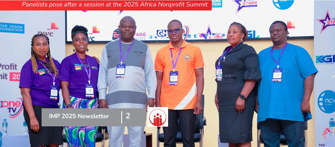
Panelists pose after a session at the 2025 Africa Nonprofit Summit

Organised by NCVO Ghana and Partnership Bureau, in partnership with IMPLEMENTERS and EcoPeriod Pad, the summit brought together over 100 participants from nonprofits across Ghana and beyond. Under the theme “ Advancing Nonprofits: Innovation & Action for Greater Impact, ” the summit lived up to its promise by delivering engaging conversations, thought-provoking sessions, and meaningful connections among participants.