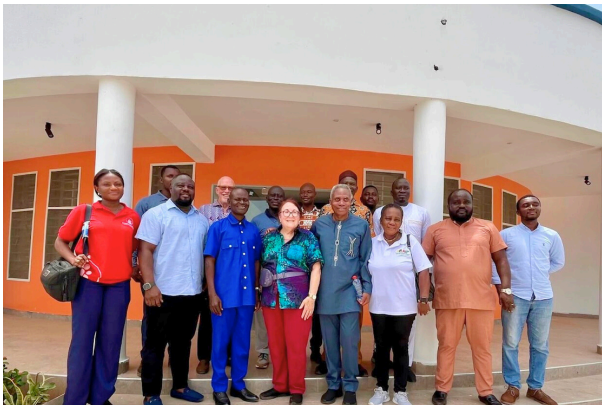
Helping Africa Foundation Executives with IMP Leadership and Local Stakeholders

On the second day, the IMPLEMENTERS team met with the assembly's grounds planning committee to fine-tune event logistics. A follow-up meeting was held at the project site with representatives from the Helping Africa Foundation (HAF) and project consultants. This inspection allowed for a joint review of final touch-ups and pending construction issues. Areas for improvement were identified and earmarked for action.