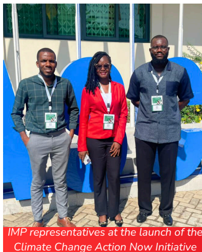
IMP representatives at the launch of the Climate Change Action Now Initiative

Centred on the theme “Powering Ghana’s Youth Towards Climate Resilience,” the event highlighted the critical role young people play in shaping Ghana’s climate response today and in the years ahead. It also fostered intergenerational dialogue, with inspiring voices from across sectors and age groups reflecting on mutual learning, shared experience, and the power of inclusive climate action.