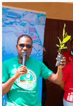
Green With Twellium: A rep from the Forestry Commission engages students on the vital role of tree planting